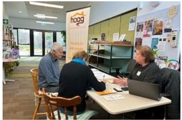
At sessions like these participants can learn about their options for accessing affordable housing, whether in Public, Community or Retirement Housing, as well as getting help with Aged Care in the home.