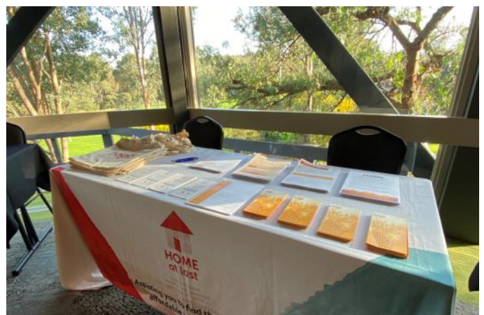
We have expanded our services brochure as well as printing new tote bags and magnets. Come to our events to get some, and let us know if you would like brochures in your language to share in your community!