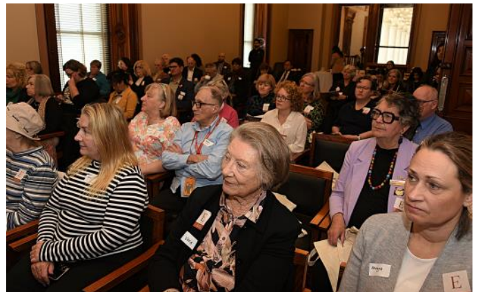
A packed room of attendees heard the troubling personal stories as well as the scale of the problem shown in HAAG's census data analysis.