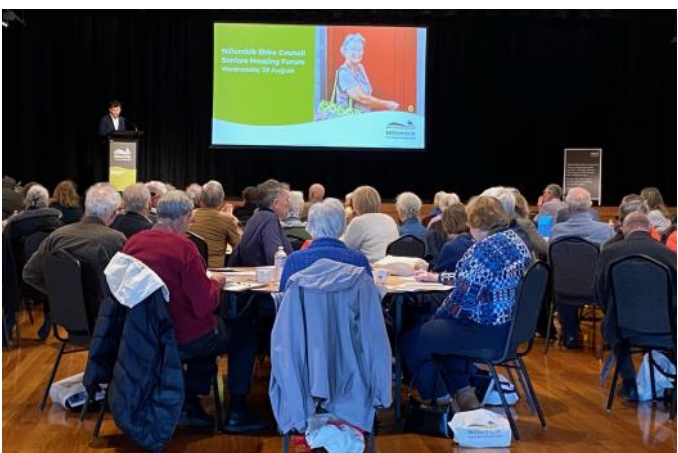
As well as State and Federal Government politics, HAAG also gets involved at a local government level, getting candidates to pledge to support older peoples housing, and pictured speaking here at the Nillumbik Seniors Housing Forum.