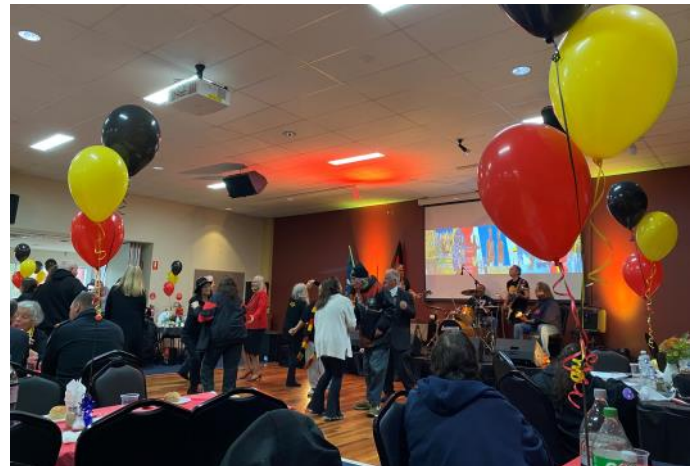
HAAG staff and members went along to the National National Aborigines and Islanders Day Observance Committee (NAIDOC) day march and elders ball.