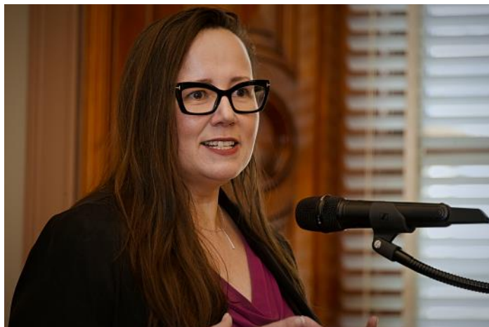
Victorian Housing Minister Harriet Shing addressing our Older Persons Housing Forum.

All levels of government, including local